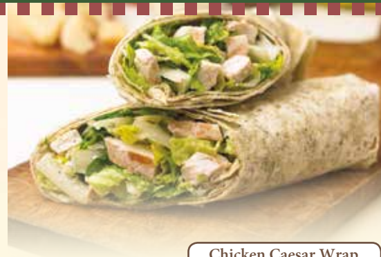
Chicken Caesar Wrap