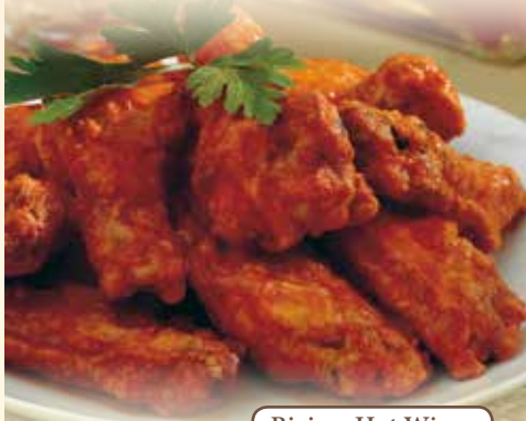
Riviera Hot Wings